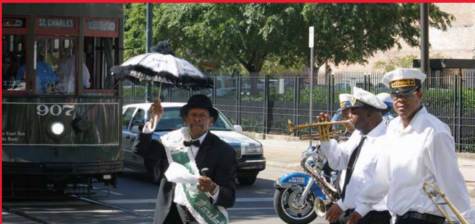
AFM represents Louisiana's famous Treme Band.

The AFM has made it easy to find and hire live professional musical entertainers online. Go to: www.gopromusic.com . Want the best in music education? AFM members are also available as music teachers: www.goprolessons.com . You'll be glad you did.