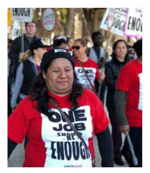
Local 19 UNITE HERE members on the picket line

Before booking at any hotel, please visit www.FairHotel.org to make sure you are staying at a union hotel that is free and clear of a risk of labor dispute. If you have any questions regarding the status of a hotel, please contact 202-661-3680. ■