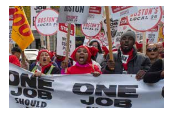
Local 26 UNITE HERE members rally on Oct. 20