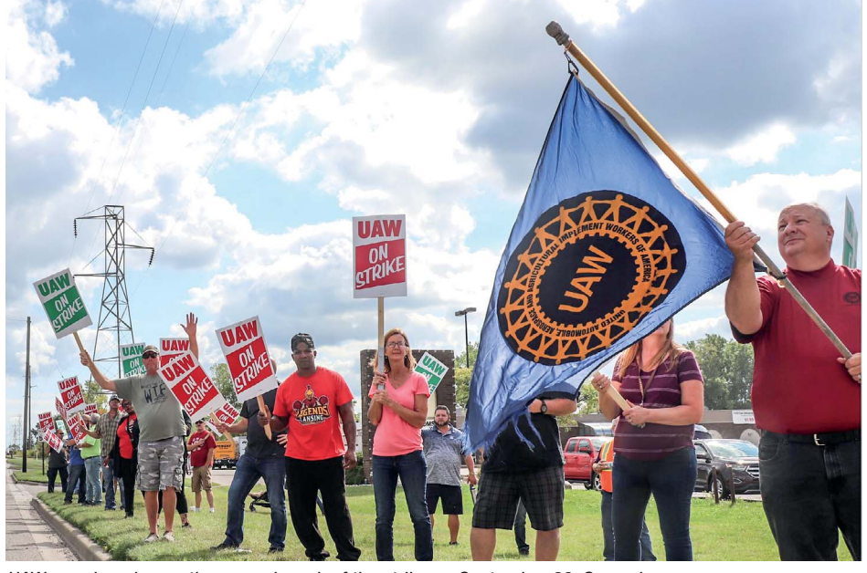
UAW members began the second week of the strike on September 23. Several Democratic presidential candidates have joined them on the picket lines.

The economic multiplier for the motor vehicle manufacturing industry is 14.28 induced jobs for every one job in the industry. That means that the industry is taking a huge hit in addition to the hit taken by GM (source: https://www.epi.org/publication/updated-employment-multipliers-forthe-u-s-economy/).