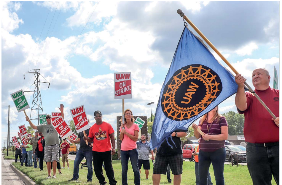
UAW members began the second week of the strike on September 23. Several Democratic presidential candidates have joined them on the picket lines.

The economic multiplier for the motor vehicle manufacturing industry is 14.28 induced jobs for every one job in the industry. That means that the industry is taking a huge hit in addition to the hit taken by GM (source: https://www.epi.org/publication/updated-employment-multipliers-for-the-u-s-economy/ ).