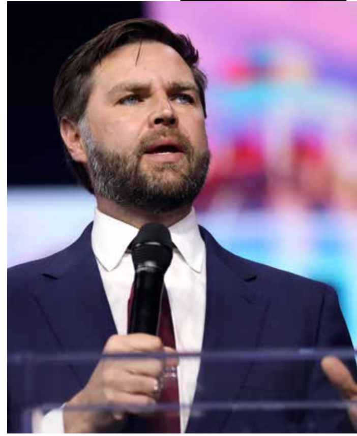
Would you rather? Walz vs. Vance on unions...