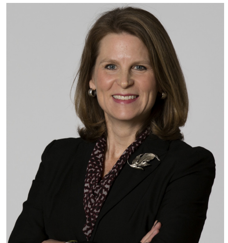
AFL-CIO President, Liz Shuler

As the first woman to lead the AFL-CIO, Liz Shuler represents a milestone in labor union history. Shuler became president in 2021 after the sudden passing of Richard Trumka and has since prioritized diversifying the labor movement. Under her