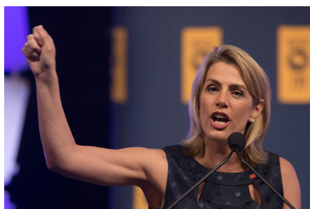
AFA President Sara Nelson addressing the AFGE Convention-Photo by AFGE

Sara Nelson has become a national face of labor activism, especially following the 2019 government shutdown, during which she called for a general strike to end the political impasse. Nelson has long championed the rights of women and