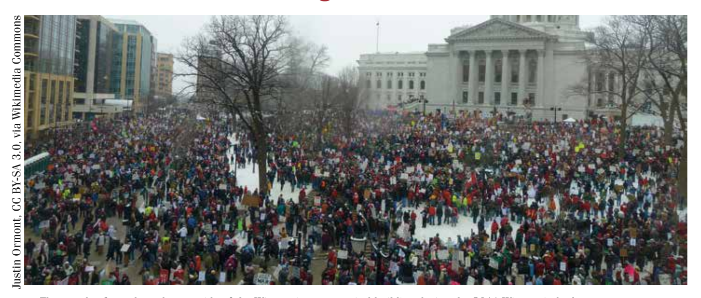
Thousands of people gather outside of the Wisconsin state capitol building during the 2011 Wisconsin budget protests.

In a landmark victory for organized labor in early December, Wisconsin unions successfully overturned major provisions of Act 10, the 2011 law that took away collective bargaining rights from most public service workers in the state. This achievement restored essential rights to thousands of Wisconsin public employees.