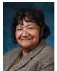
By Lorretta Johnson, Secretary-Treasurer, American Federation of Teachers

It's no coincidence that a union willing to take these stands finds itself under attack. Across the country, politicians and well-funded organizations such as the American Legislative Exchange Council (ALEC), the billionaire Koch brothers, and super PAC after super PAC are using frivolous lawsuits, cookie-cutter legislation, and polarization to divide and conquer. Just last month, these anti-